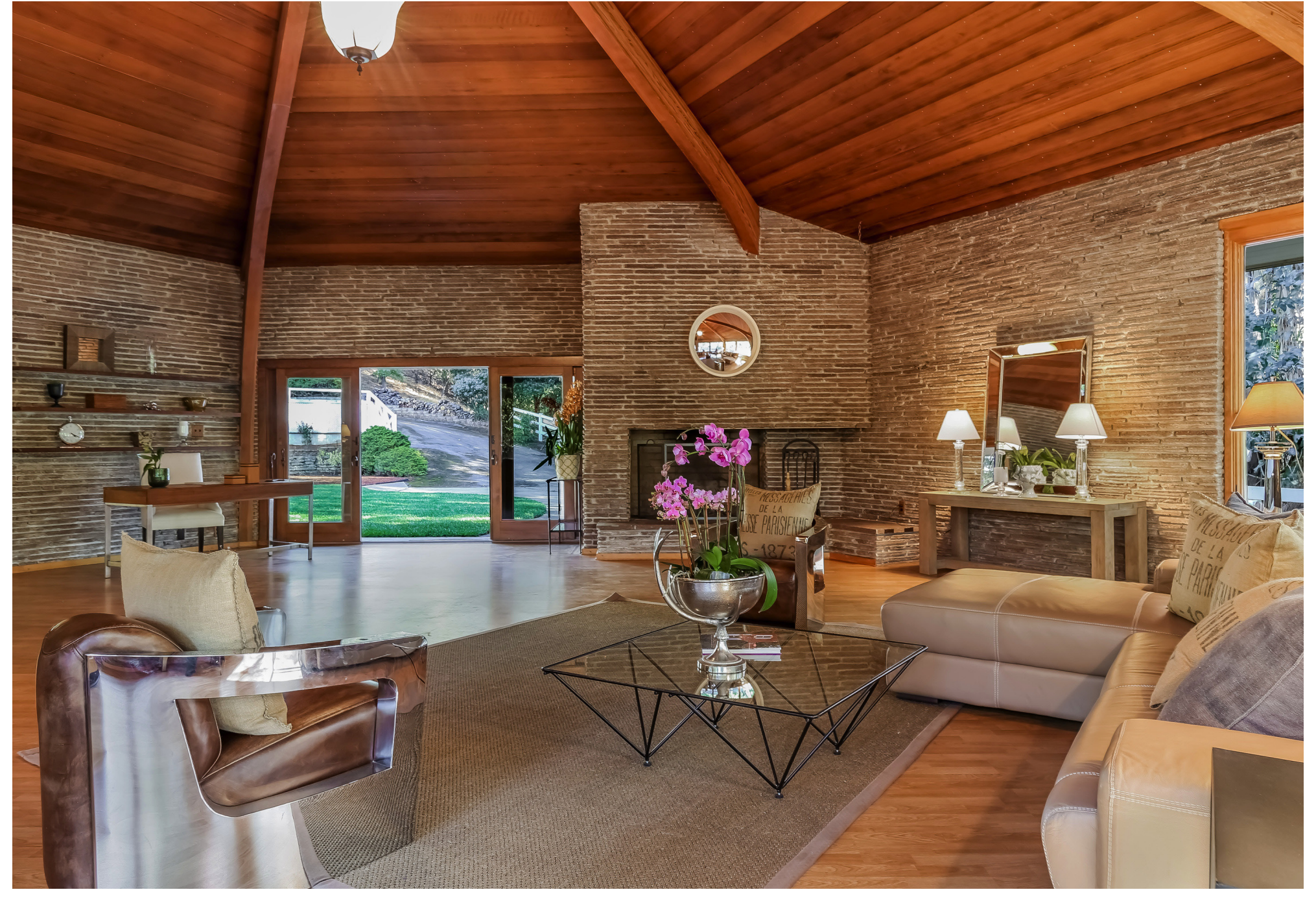
UNIQUE ~ ELEGANT ~ CAPTIVATING

Sophistication meets functionality in this unique Mid-Century home. The spacious floor plan and walls of windows throughout the home showcase serene sylvan views from virtually every room in the home. The breathtaking circular great room is perfect for holiday parties and gala events.