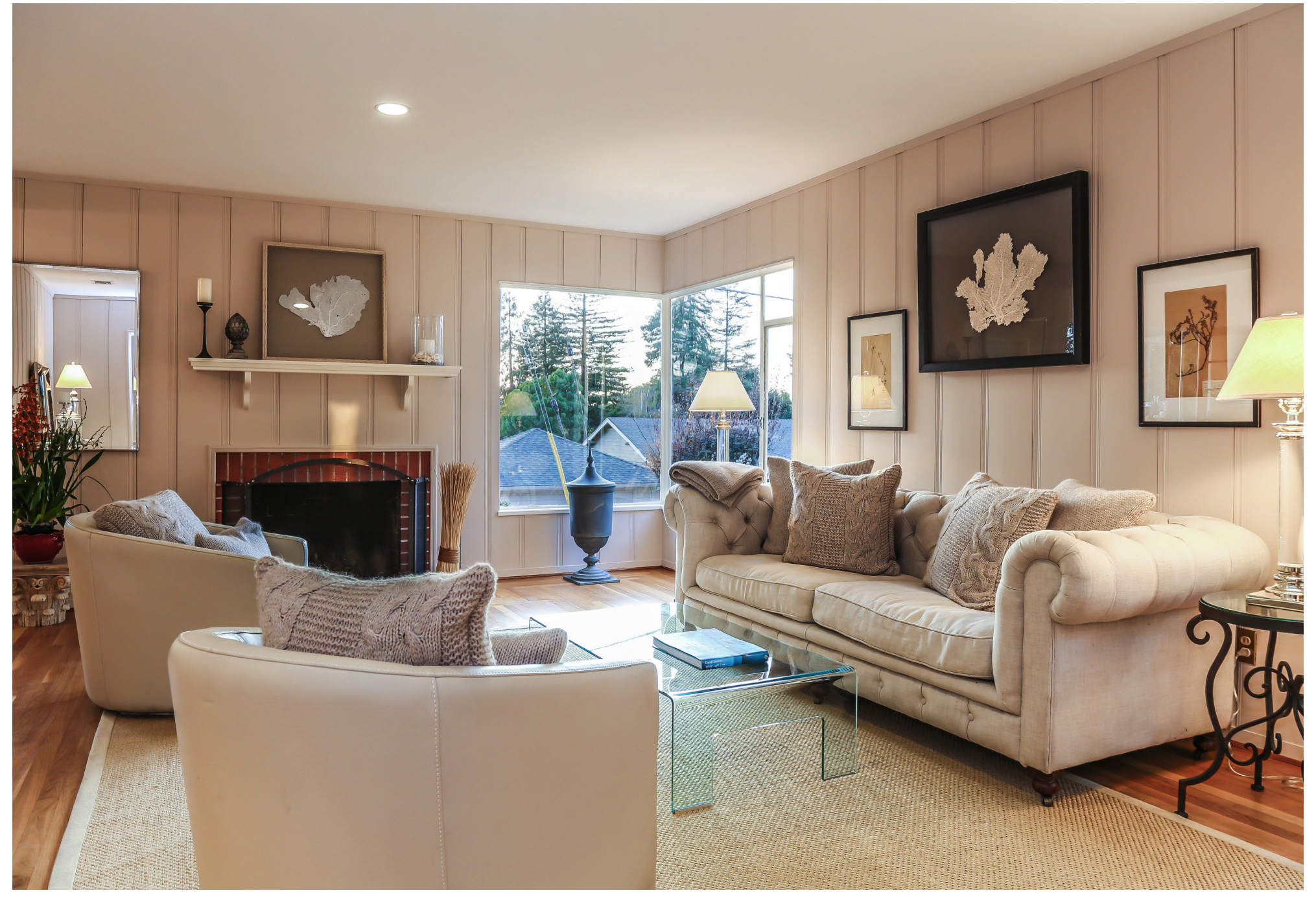
SPACIOUS ~ ELEGANT ~ INVITING

Sophistication meets functionality in this beautiful mid-century home. The flowing floor plan offers spacious rooms with character and plenty of natural light. The living room and dining area showcase peaceful bay views. Holiday gatherings with family and friends come to mind.