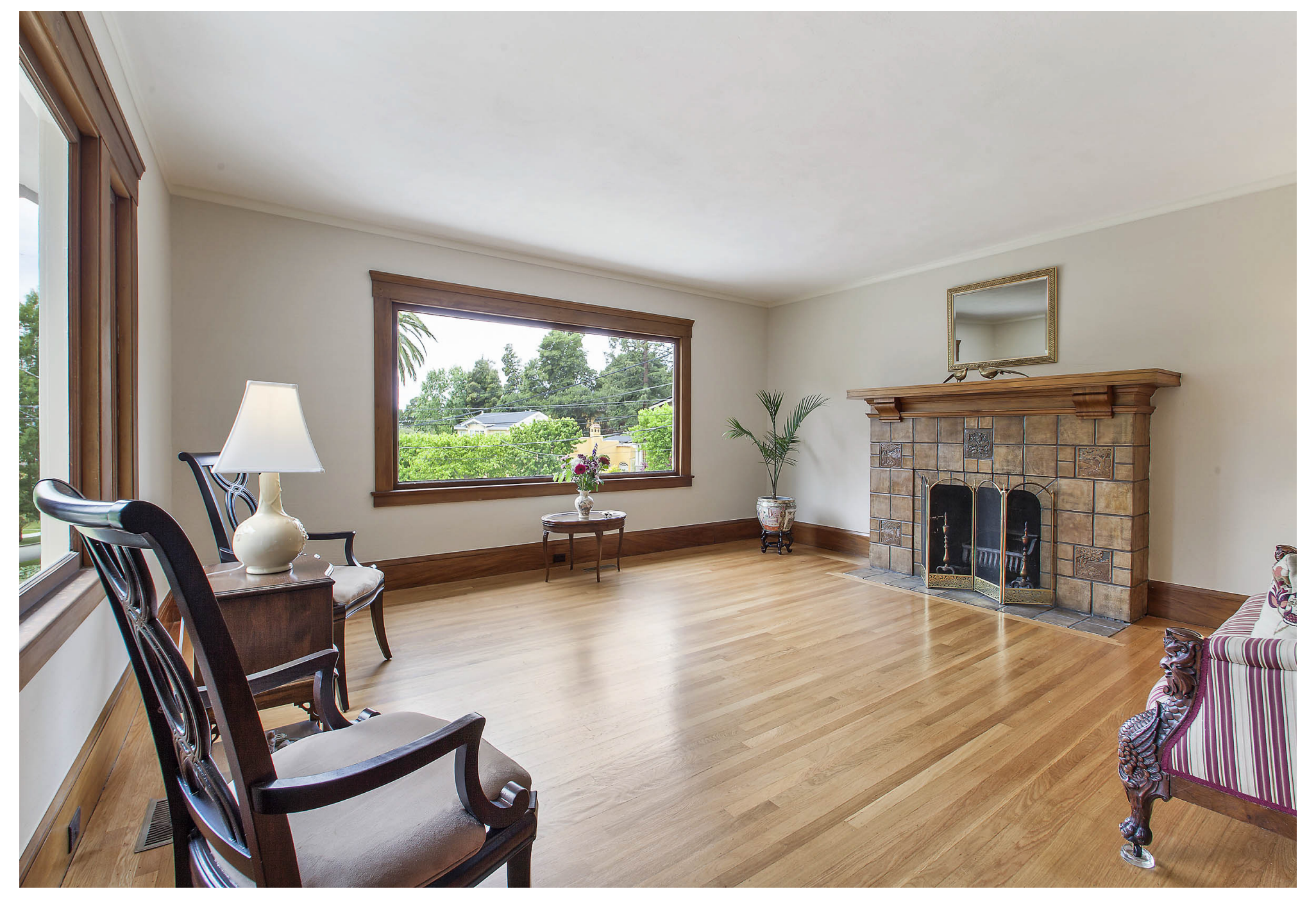
WARM ~ ELEGANT ~ CAPTIVATING

This stunning traditional home offers an abundance of natural light. Enjoy visiting with family and friends while overlooking the striking filtered San Francisco City view and the Rockridge Place Parkette - the pride of the neighborhood. Visions of holiday gatherings come to mind.