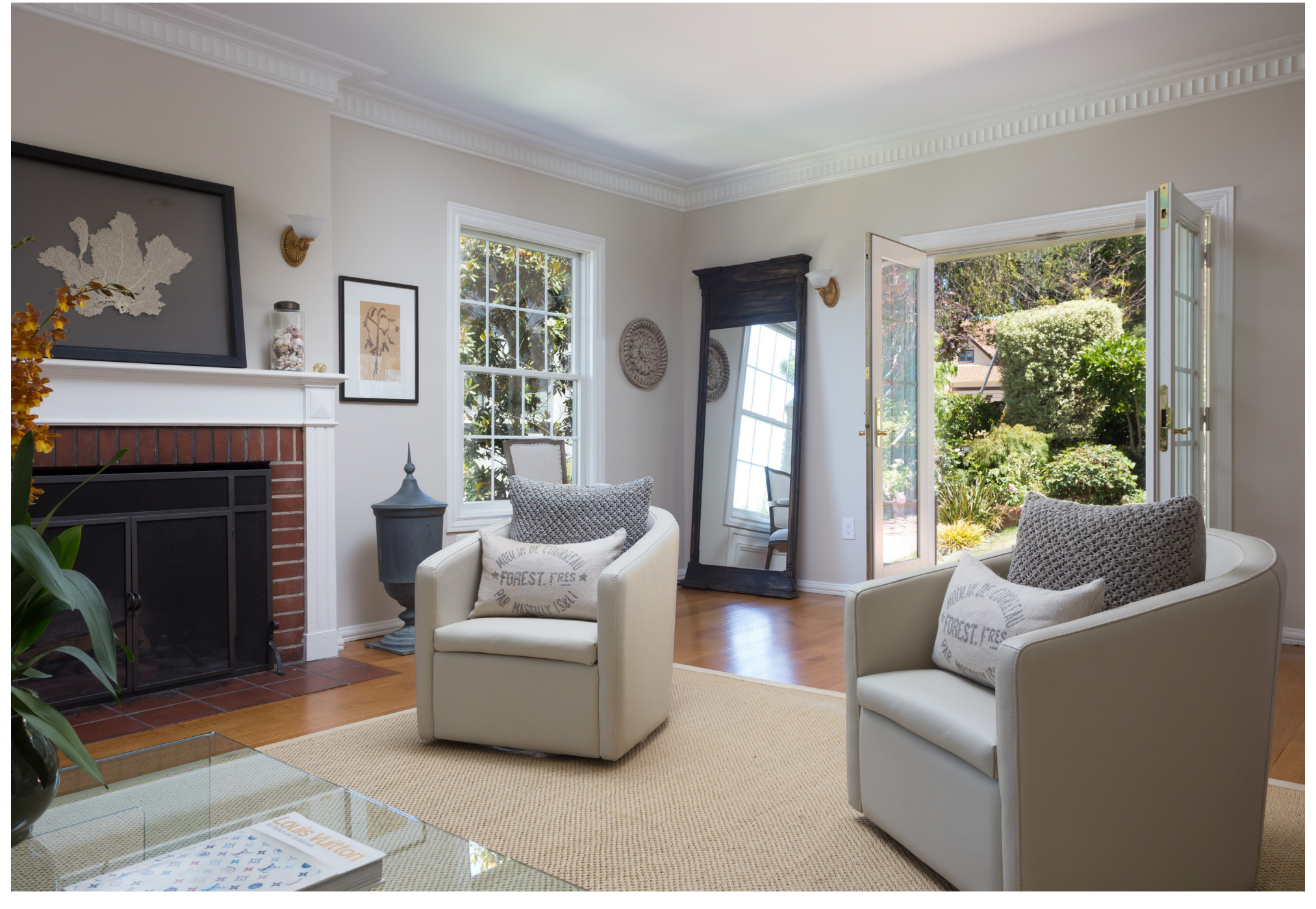
WARM ~ ELEGANT ~ INVITING

This stunning traditional home offers an abundance of natural light. The flowing floor plan and great separation of space make this home ideal for family and friends to gather. It is an entertainer's delight. Visions of holiday celebrations come to mind.