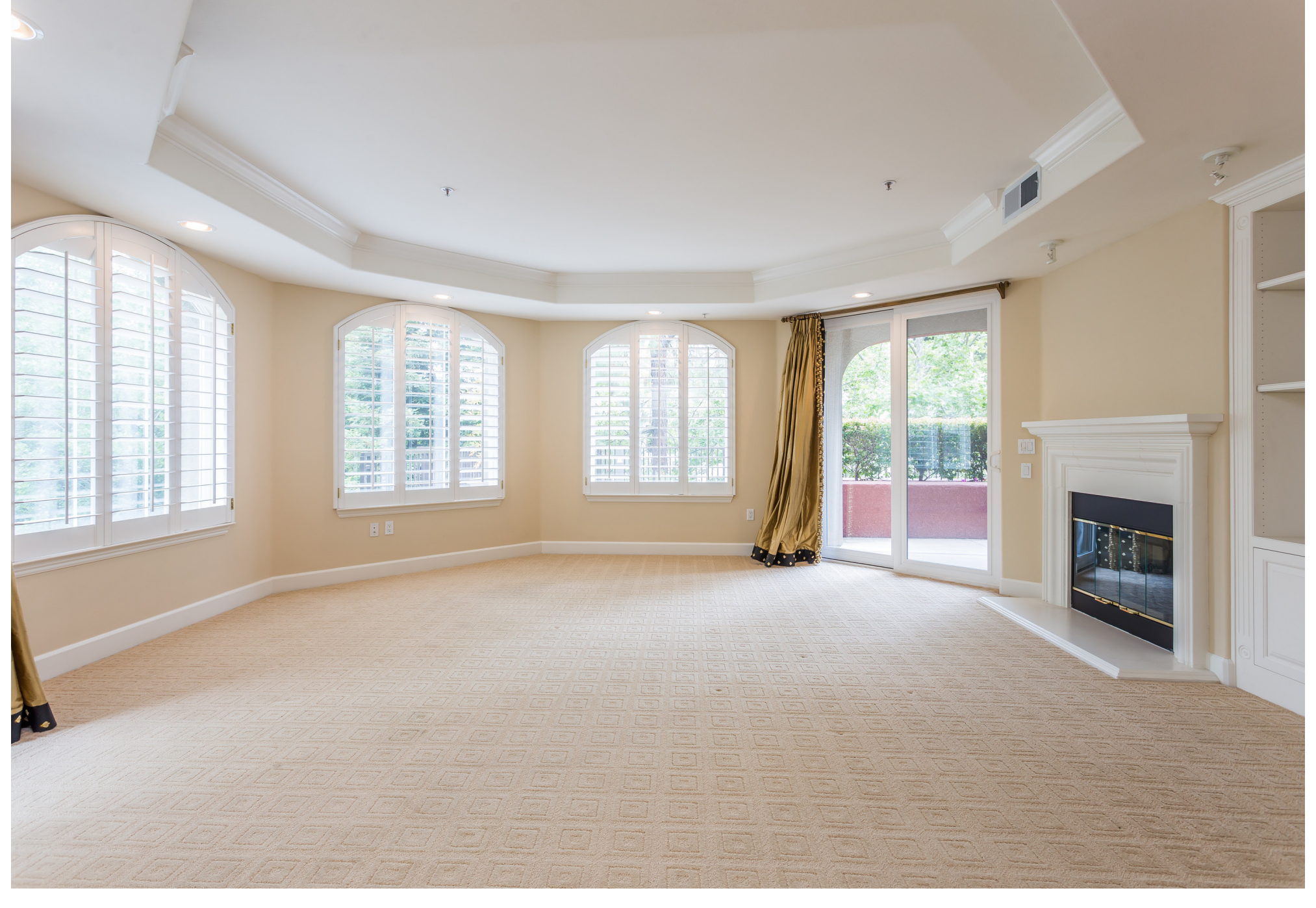
WELL DESIGNED - OPEN FLOOR PLAN

This three bedroom, two bathroom, premium quality condominium home is a corner unit on the first floor. The living room allows in plenty of natural light and full ventilation across the well thought out open floor plan. A sliding door provides direct access to the patio for indoor-outdoor living.