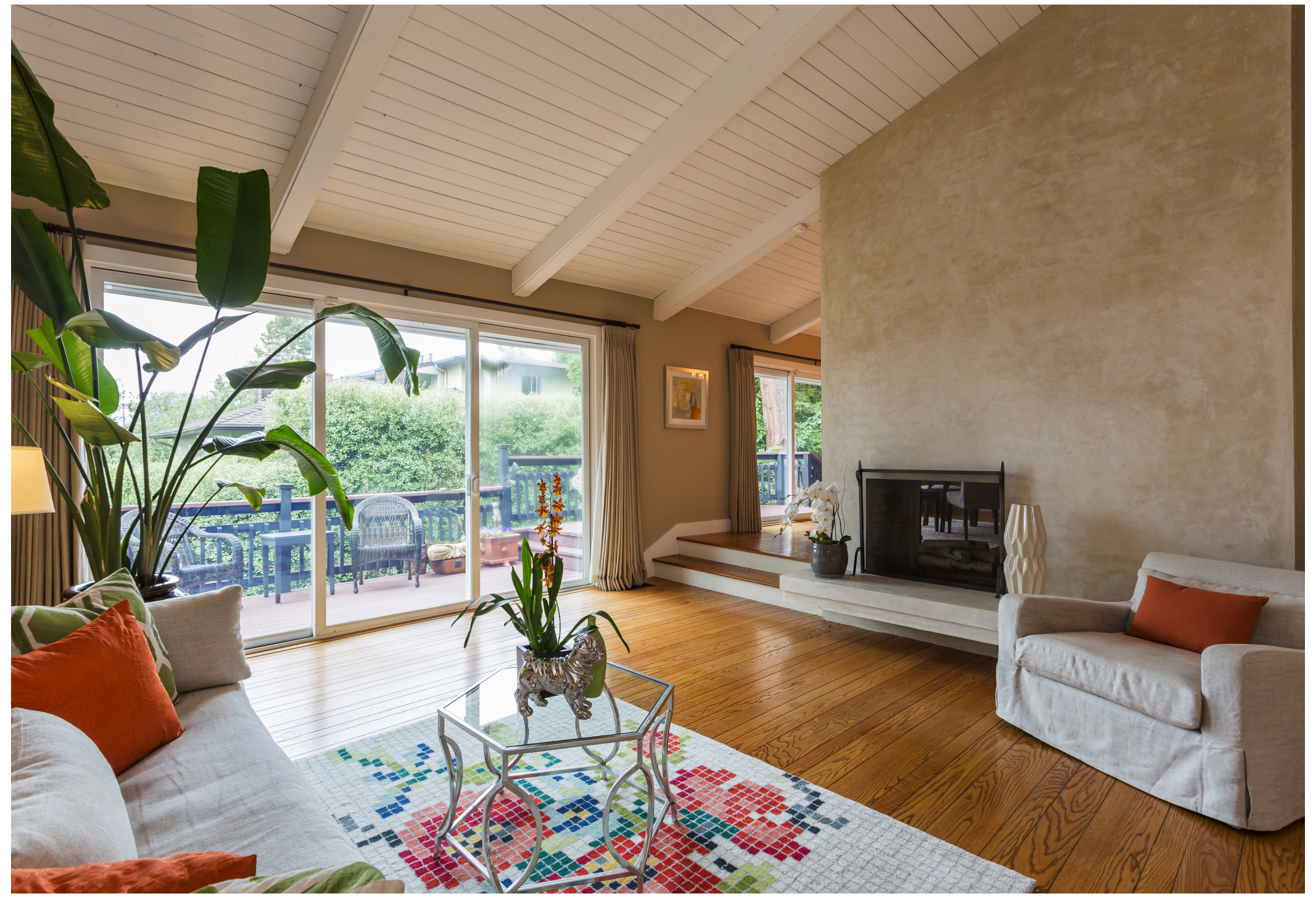
TRANQUIL ~ ELEGANT ~ INVITING

It is a stunning entrance into this 2,137 square foot, three bedroom, three bathroom contemporary; high vaulted ceilings compliment the warm and inviting ambiance of the main level of this special home. A two-sided wood burning fireplace bestows a refined elegance upon both living and dining rooms.